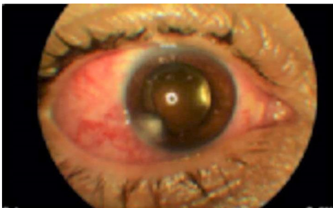
Figure 1: Anterior segment photo, showing corneal infiltrate at the phacoemulsification wound.

Mild lid swelling, severe conjunctival injection, cornea showed loose suture at the phacoemulsification main wound with apposed edges and small infiltrate 1.5*1.5 mm inferotemporal with small epithelial defect overlying it (without leak); Seidel's test negative.